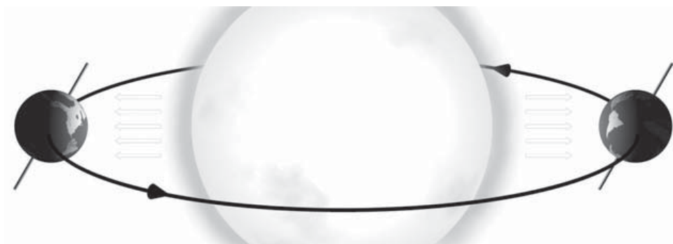
The true explanation of seasons (not to scale!)

falling vertically in one hemisphere (thus providing more heat per unit area of the surface) they are falling obliquely in the other (thus providing less).